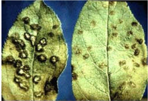
Apple scab lesions on apple leaves.

Symptoms first appear in the spring as spots (lesions) on the lower leaf surface, the side first exposed to fungal spores as buds open. At first, the lesions are usually small, velvety, olive green in color, and have unclear margins. On some crabapples, infections may be reddish in color. As they age, the infections become darker and more distinct in outline. Lesions may appear more numerous closer to the mid-vein of the leaf. If heavily infected, the leaf becomes distorted and