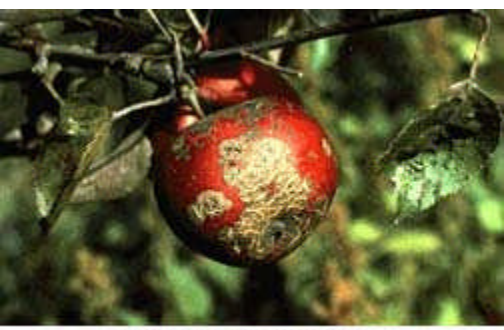
Apple scab lesions on fruit.

Apple scab is caused by the fungus, Venturia inaequalis . It survives the winter in the previous year's diseased leaves that have fallen under the tree. In the spring, the fungus in old diseased leaves produces millions of spores. These spores are released into the air during rain periods in April, May and June. They are then carried by the wind to young leaves, flower parts and fruits. Once in contact with susceptible tissue, the spore germinates in a film of water and the fungus